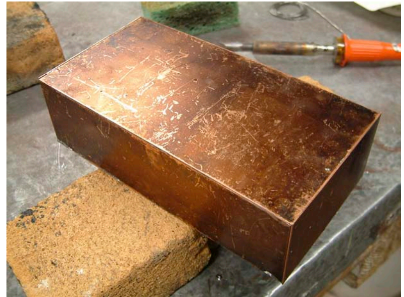
Brick with the marks of its own making and unmaking. (work in progress), 10.5 mm x 20 mm x 6 mm, copper, 2009